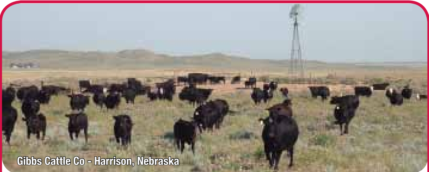
Gibbs Cattle Co - Harrison, Nebraska